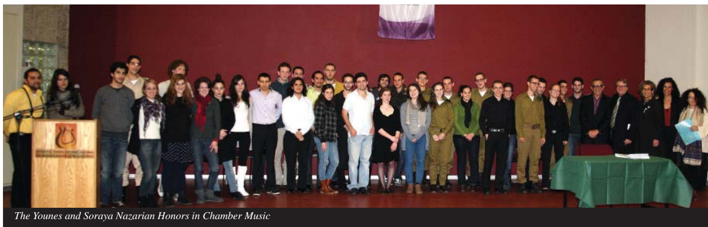
The Younes and Soraya Nazarian Honors in Chamber Music