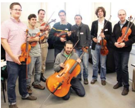
Students of the Franz Liszt Academy in Jerusalem