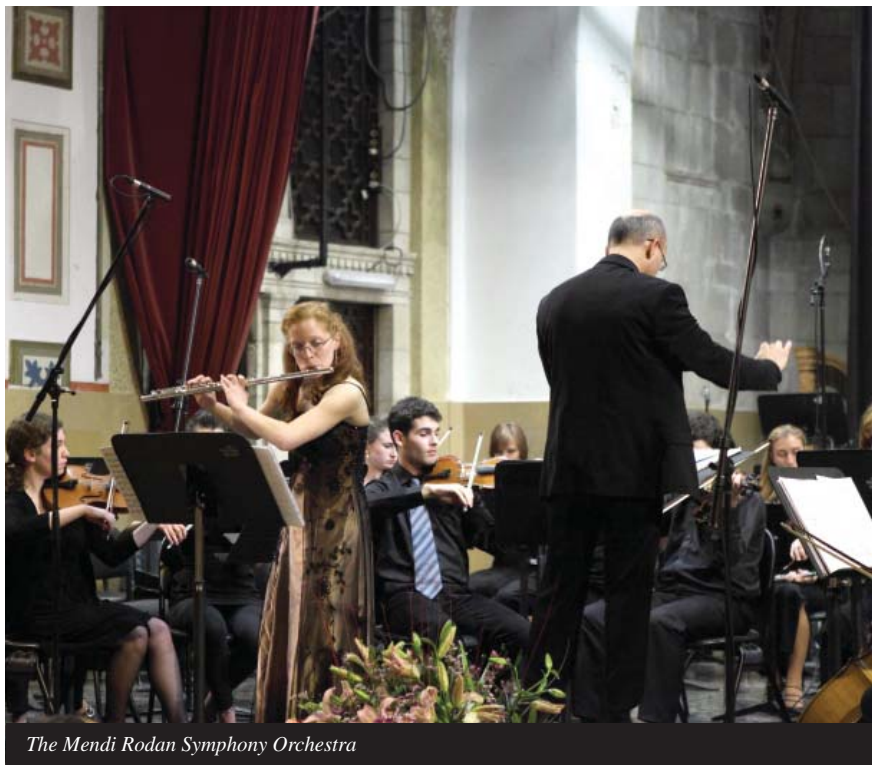
The Mendi Rodan Symphony Orchestra