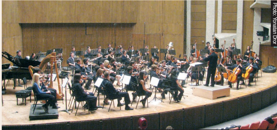
The Academy's New Symphony Orchestra